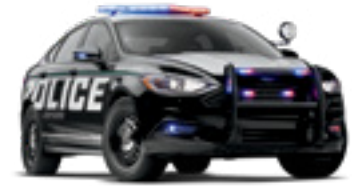
Police Responder Hybrid Sedan