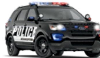
Police Interceptor Utility