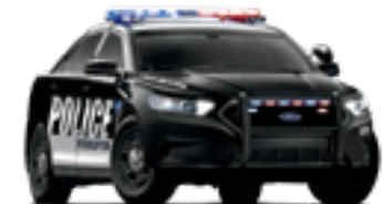
Police Interceptor Sedan/SSP