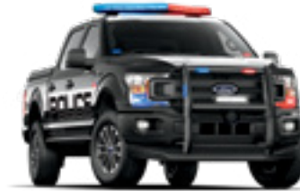
F-150 Police Responder/SSV

GET THE VEHICLE YOU WANT, THE WAY YOU WANT.